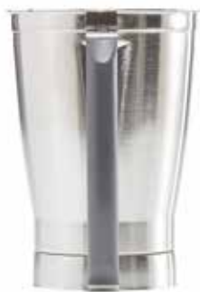
Stainless steel bowl and blade